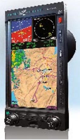
Aspen Avionics' Evolution flight display system