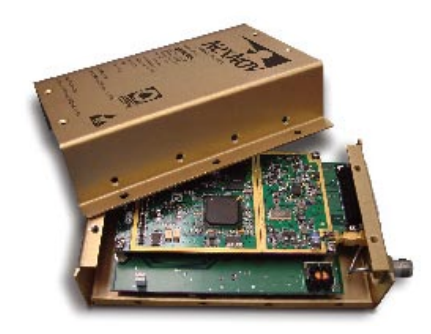
Spectralux's NexNav global navigation satellite system WAAS sensor

During the AEA "New Product Introductions," Spectralux Corp. focused on its new NexNav