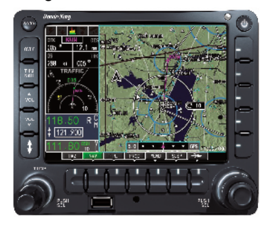
Bendix/King's KSN 770 multi-function display

The new KFD 840 primary flight display, designed for piston aircraft, interfaces with existing navigation systems and autopilots. It features an 8.4-inch high-resolution LCD display and replaces the entire "six pack" of analog primary flight instruments. Each of the avionics can stand alone or integrate with existing autopilot or GPS systems. Honeywell anticipates deliveries to begin in late 2008.