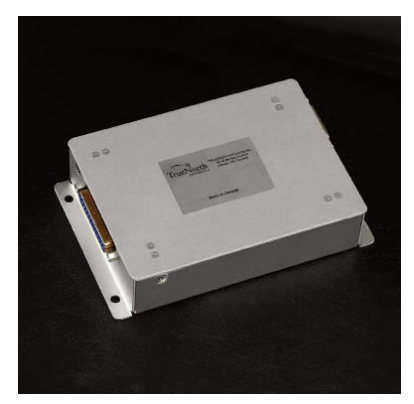
TrueNorth's data-link unit

communications worldwide via their ACARS- or AFIS-equipped aircraft. Incorporating an embedded Iridium satcom transceiver, the Simphonē DLU works with Simphonē Chorus and Duo airborne telecommunications systems, as well as third-party airborne telephones, to let flight crews communicate with the ground or other aircraft via Iridium's short-burst data service.