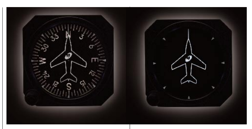
Mid-Continent Instruments' 3300 series electric directional gyro

Weighing 1.8 pounds, the 3300 series directional gyro is about one pound lighter and 1.25 inches shorter than most standard gyros. MCI incorporated