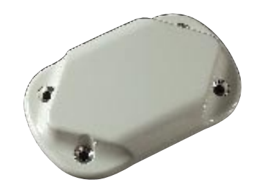
Comant's C190 TSO WAAS GPS antenna

A simple drop-in replacement for an existing GPS antenna, the TSO-certified C190 offers an