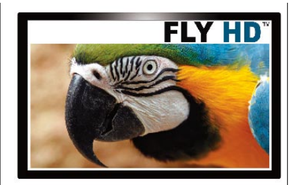
Flight Display Systems' 42-inch wide-screen HD LCD monitor

Up to seven monitors can be connected to one Blu-ray player and play 1080p HD-quality videos.