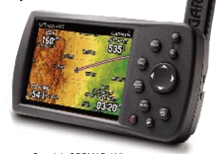
Garmin's GPSMAP 495

In other news, Garmin added FliteCharts and SafeTaxi capability to its GMX 200 multi-function display. FliteCharts and SafeTaxi also have been added to the G600 retrofit glass cockpit. Garmin expects certification and product deliveries in late July 2008.