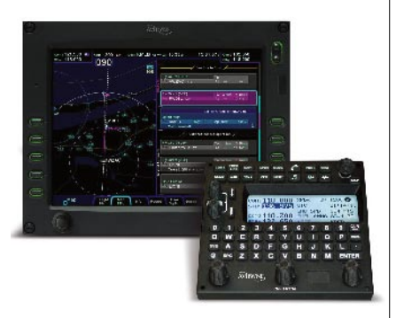
Avidyne's FMS900w flight management system

Available in the second quarter of 2008, Avidyne's TWX670 tactical weather detection system