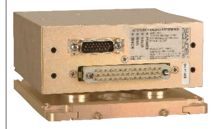
Sandel Avionics' SG102 attitude heading reference system

The company also expanded its STC approved model list to certify installation of the SA4550 in several Collins-equipped turbine aircraft models. Plug-compatible with the Collins ADI-84, ADI-84A and the 329B-7R series of flight directors, the SA4550 mates to the existing aircraft wiring harness and connector to