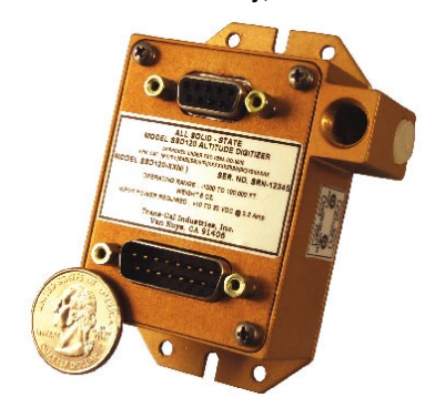
Trans-Cal's SSD120 Nano altitude encoder

The encoder weighs 5.6 ounces and measures 1.12" x 3.4" x 2.46". The Nano, which includes a 42-month warranty, boasts