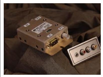
DPI Labs' PVS personal video switcher

Compatible with iPods and other video sources, the new switcher allows video integration into bulkhead or personal LCD monitors without cabin entertainment or cabin management sys-