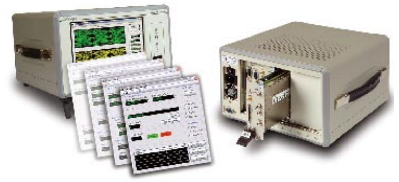
Aeroflex's Avionics Test Bench and Avionics Test Studio

Aeroflex's new avionics testing platform is the Avionics Test Bench, which is available in two configurations. The basic configuration, the ATB-3000, includes an Aeroflex touch-screen PXI chassis with built-in controller and an Aeroflex 3025C RF signal generator and synthesizer module.