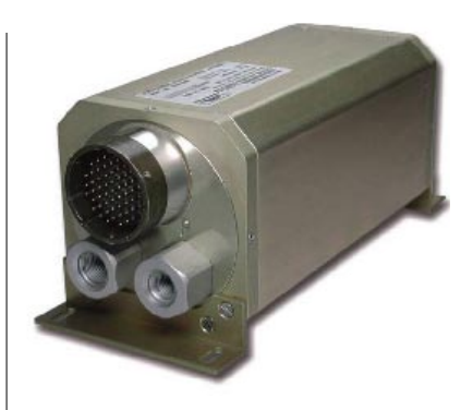
Revue Thommen's AC33 air-data computer

According to Revue Thommen, the system is extremely robust, withstanding rotary-wing gunfire vibration and shock testing, as