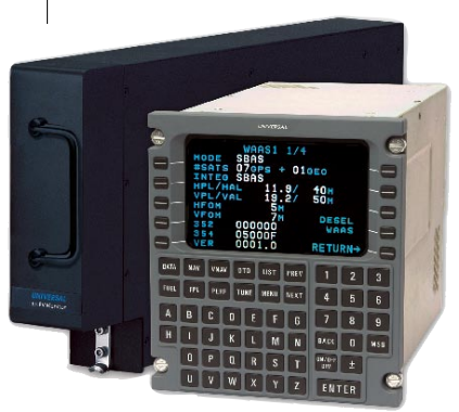
Universal's LP/LPV monitor

The unit is compatible with any Universal Avionics WAAS-FMS. Together, the LP/LPV monitor and WAAS-FMS make it possible to obtain operational approval