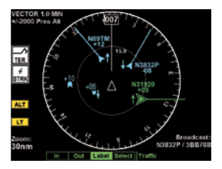
Received by a universal access transceiver, this traffic information service displays a 3-D picture of traffic relative to position.