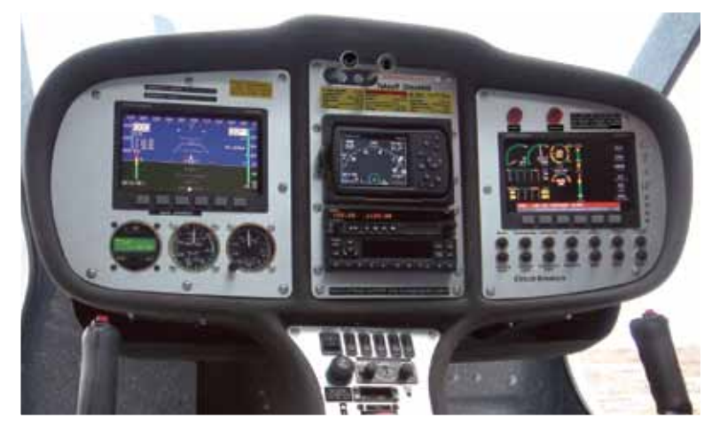
A good percentage of new light-sport aircraft, such as this Flight Design CTLS, sport the same avionics package: Dynon glass, Garmin avionics, and a handheld GPS 396/496 with XM weather in an AirGizmo panel-mount.

Database compatibility is another important part of any digital avionics system, and the available databases seem endless. The most common are instrument