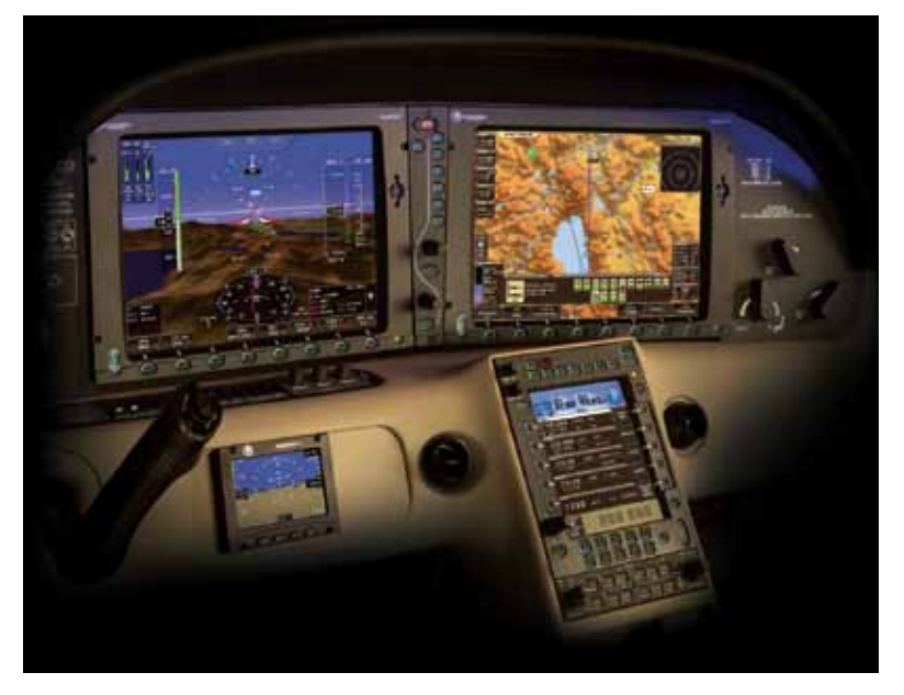
L-3 Avionics Systems' SmartDeck with synthetic vision and its Trilogy ESI-1000 electronic standby instrument.

Currently, both systems are deployed in Miami, Fla.; they should be online in the Gulf of Mexico, Louisville, Ky., Philadelphia, Pa., Houston, Texas, and Juneau, Alaska, in 2010, and running nationwide in 2013, according to the FAA's "NextGen Commitments & FY09 Work Plan."