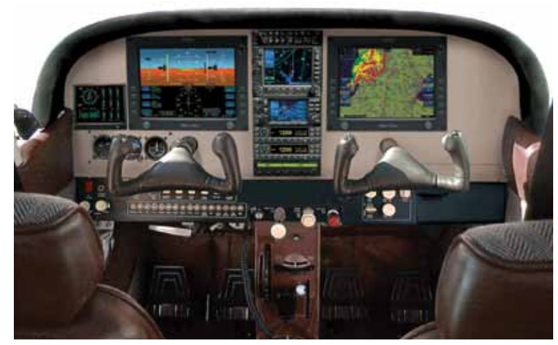
The Cessna Turbo 210 is still an excellent IFR traveling machine, and upgrading it with Avidyne's Entegra will give it free range in NextGen.

As their systems grew, pilots carried more processed wood pulp. The seed, an airport guide like the "AOPA Airport Directory" and sectional charts, grew into robust trunks of IFR en route and terminal charts, subdivided into thick binders standing together like growth rings on a geographic tree.