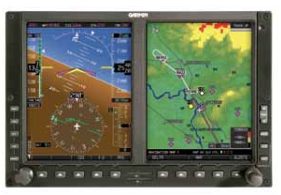
Garmin's G600 is just one upgrade option for a growing number of airplanes built during the heyday of analog aviation.

Adding capabilities to a digital avionics system (synthetic vision is the latest) often requires little more than a software upgrade and any applicable peripherals. For the cost-conscious aviator, this can help make it simpler to build a new digital avionics system one component at a time.